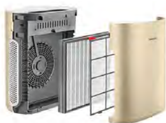
Pre filter – panel type