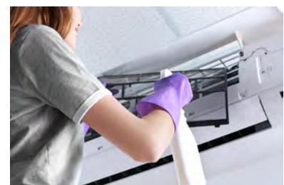
Pre filter of air conditioner