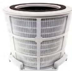
Pre filter – basket type